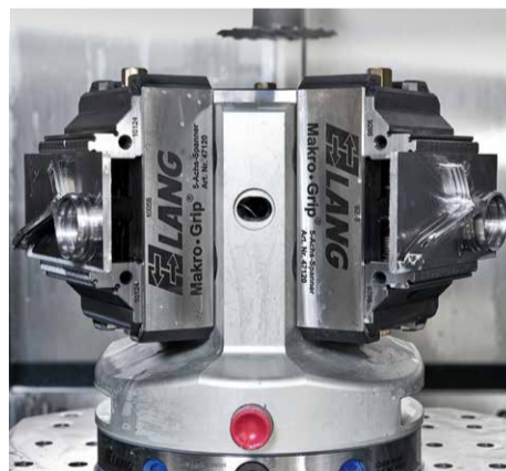
Left: The working area of the five-axis C 22 U machining centre with the swivelling rotary table on which a multiple clamping system is installed. Right: The line of five-axis machining centres: the C 22 U featuring PW 150, the C 12 U with RS 05, and the C 40 U in the new production centre at Fetzer Medical GmbH & Co. KG

Two C 22 U high-performance five-axis CNC machining centres are equipped with 11-pallet changers/storages of type PW 150, and are used for the flexible production of a wide range of components in lots up to 300 pieces. Another high-performance five-axis CNC machining centre of type C 12 U is combined with an RS 05 robot cell for the manufacture of a modular-design scissors range. Since all the installed Hermle machining centres are essentially based on the same concept and on the same control and operating philosophy, operators are quickly familiarised with running the various machines, and staff confidence and acceptance of the machinery is enhanced as a result. That is advantageous, firstly, in terms of the machines' productivity. They are run basically in single-shift mode under operator control, though the aforementioned machining centres with the pallets and robot system do of course run overnight and at weekends for automated machine loading.